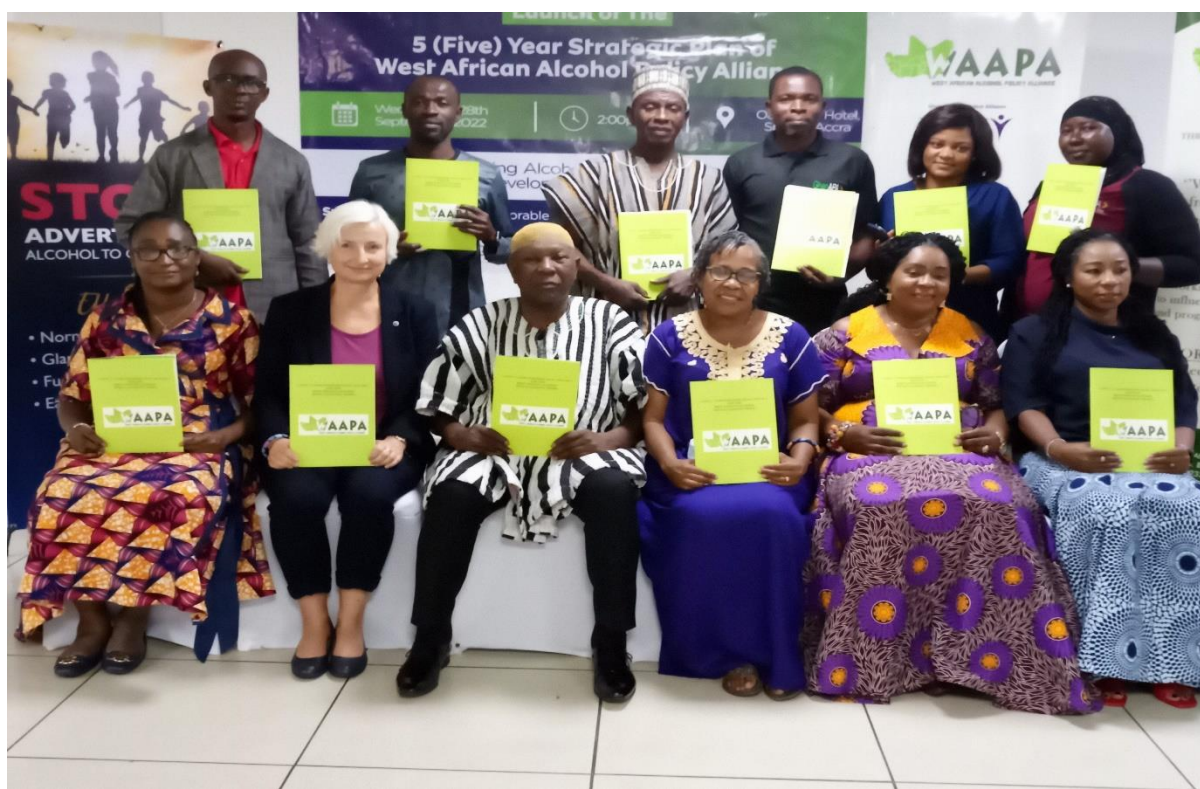
Members of GhanAPA at the launch of WAAPA 5-Years strategic plan