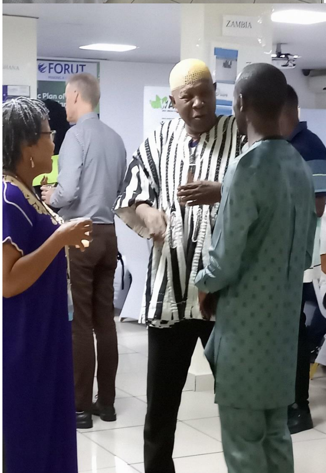
Deputy Minister of Health in a chat with SAAPA and GhanAPA chair