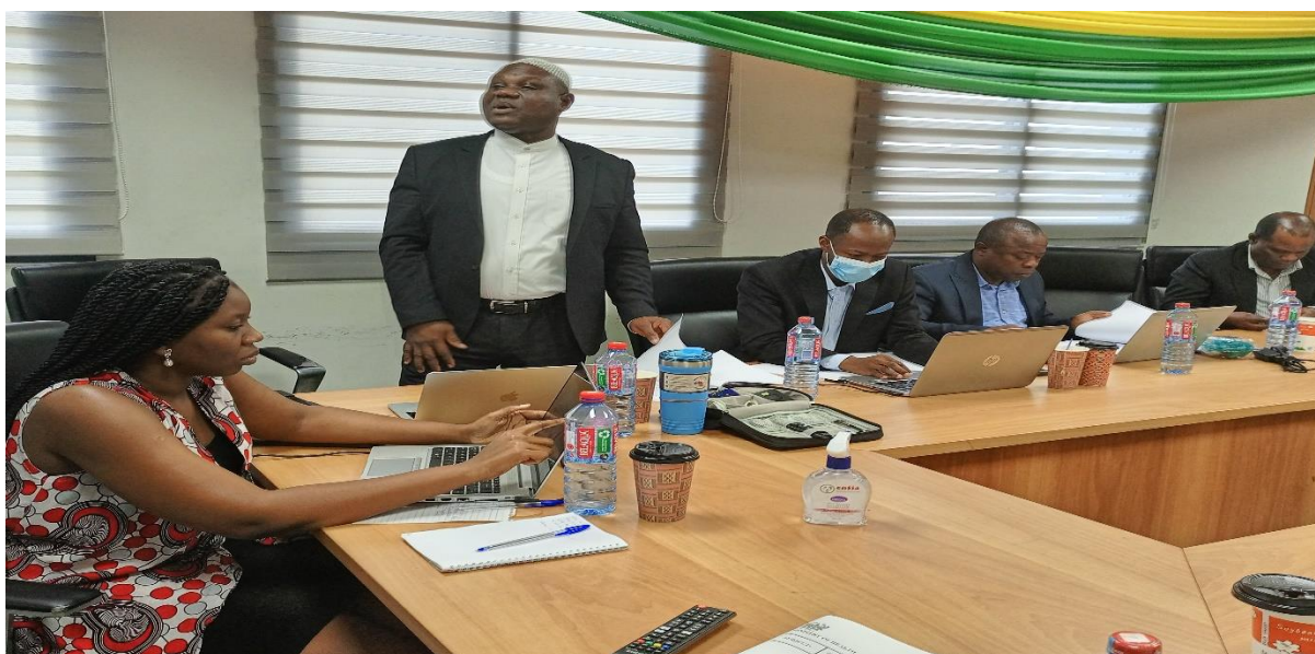
The Head of legal at the Ministry of Health making a submission during the draft regulations form review