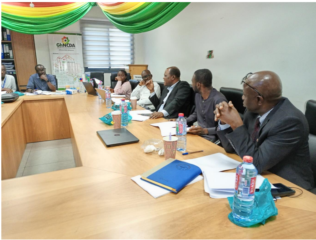
Some pictures during the (Technical Working Group) meeting on the draft alcohol regulation form