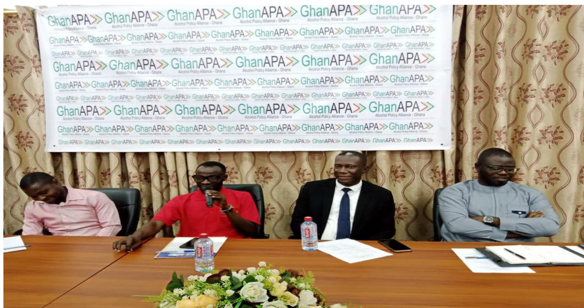
A group picture after 26 th May, 2022 National Forum on Drugs and Alcohol