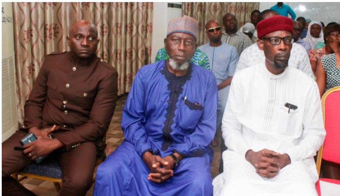
Some representatives from the office of the National Chief Imam at the launching