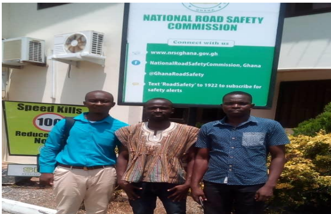
After a successful meeting with the National Road Safety Commission (NRSC)