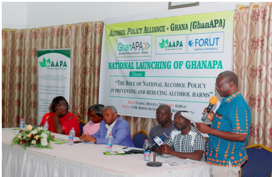
A representative of the National Youth Authority was not left out