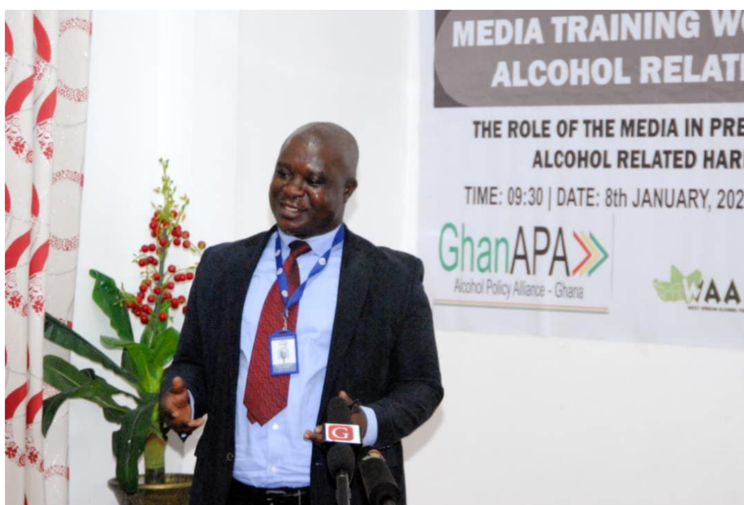
A representative of the Food and Drugs Authority, Making his presentation at the Media Training workshop