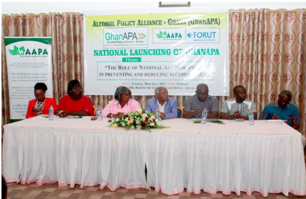
Officials seated on the high table at the launching of GhanAPA