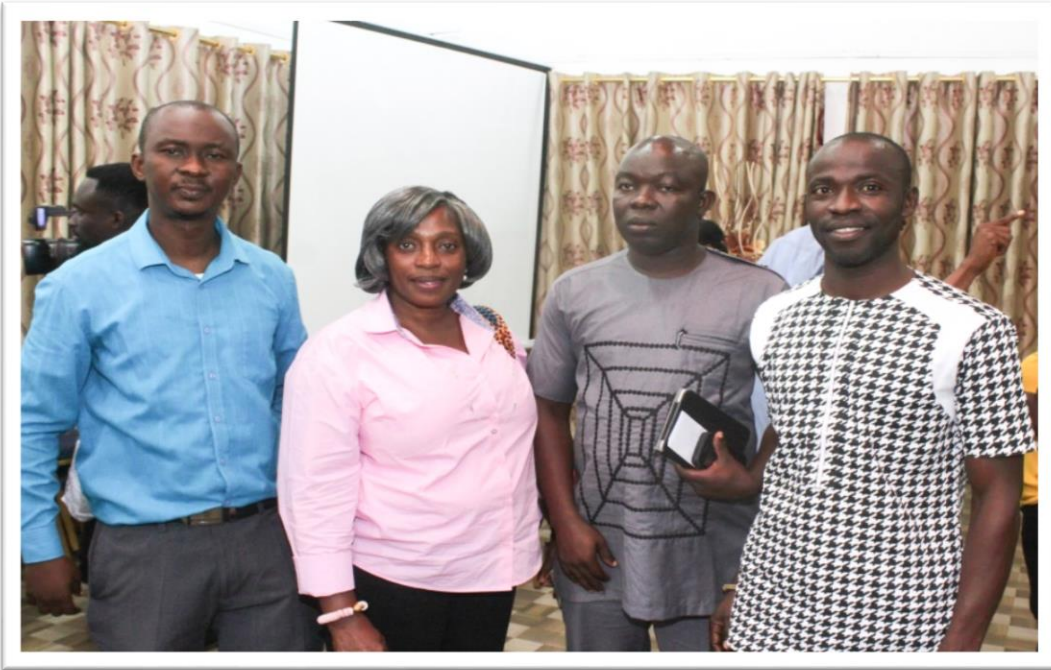
From Right; GhanAPA Chairman, Head of WAAPA Secretariat, GhanAPA Vice Chair and GhanAPA Coordinator at the launching