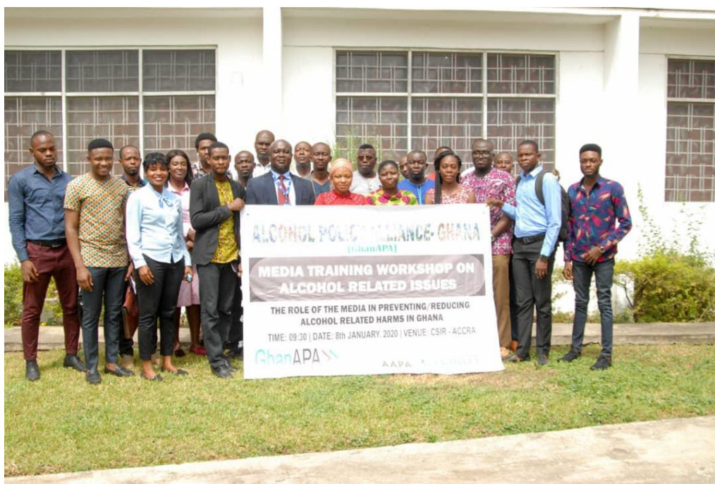
Group picture after the Media Training