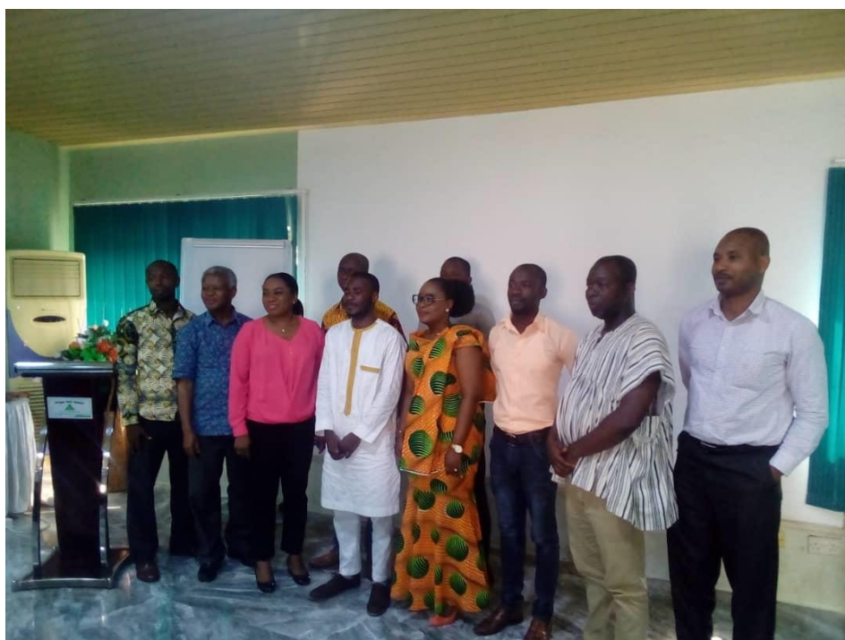
Group picture of the Sub Technical working group during the meeting to review the Alcohol (LI) Regulations document