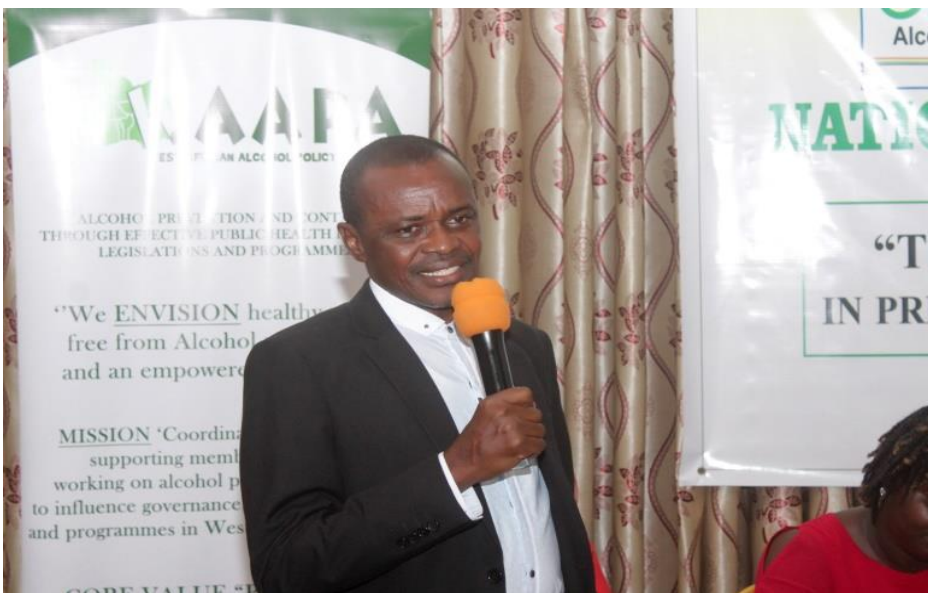
A representative of the National Road Safety Commission delivering his speech at the event