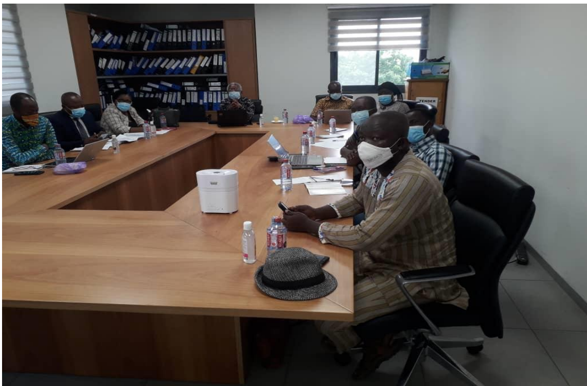
A photograph taken during the Technical meeting on the 30 th December, 2020