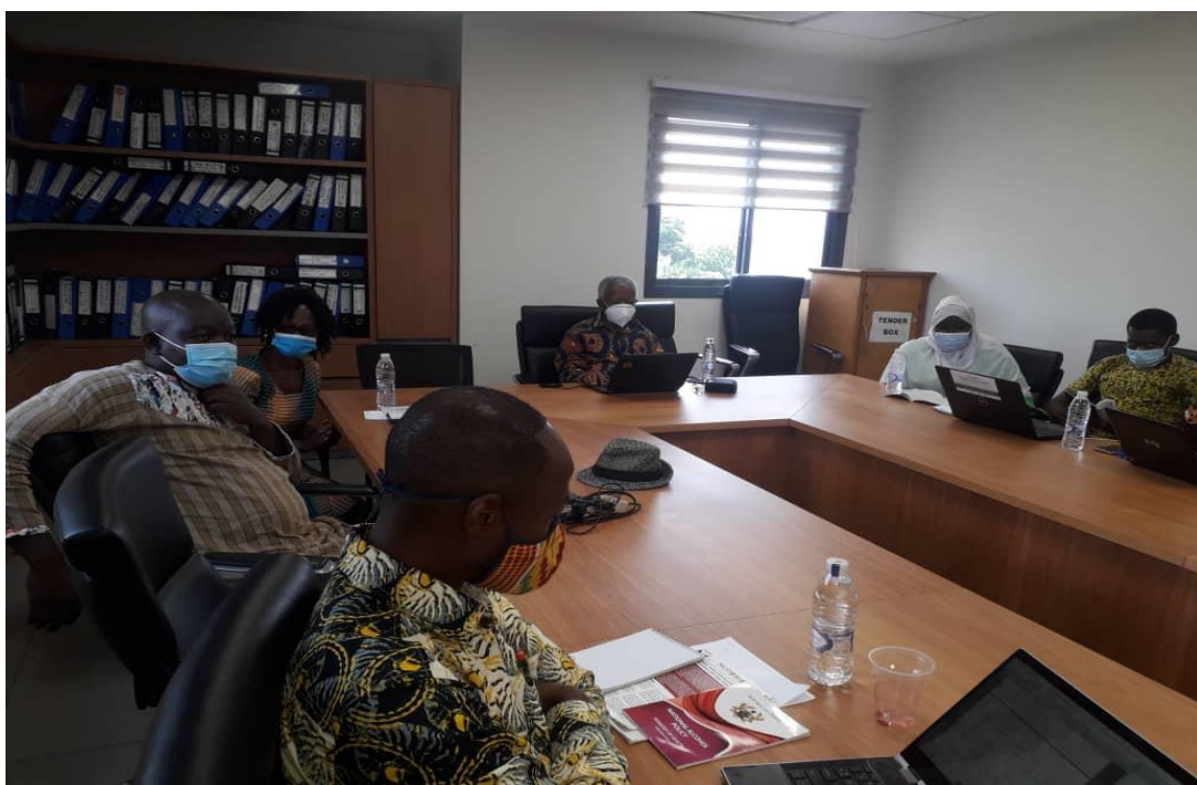
A picture during the 10 th December, 2020 Technical meeting