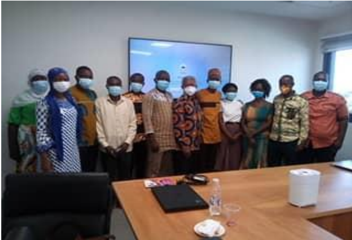
A group picture after 10 th December, 2020 Technical meeting