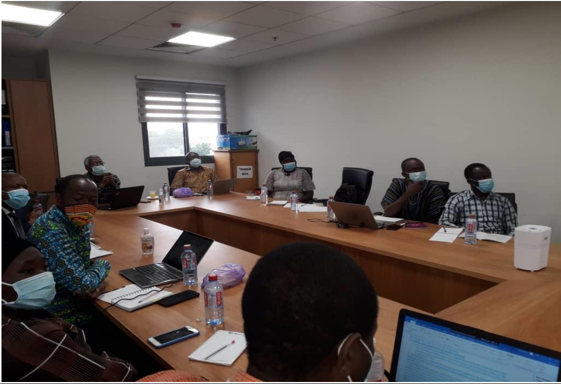
A photograph taken during the Technical meeting on the 30 th December, 2020